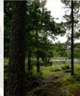
Färnebofjärden National Park, nearby our course venue