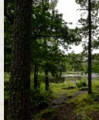
Färnebofjärden National Park, nearby our course venue